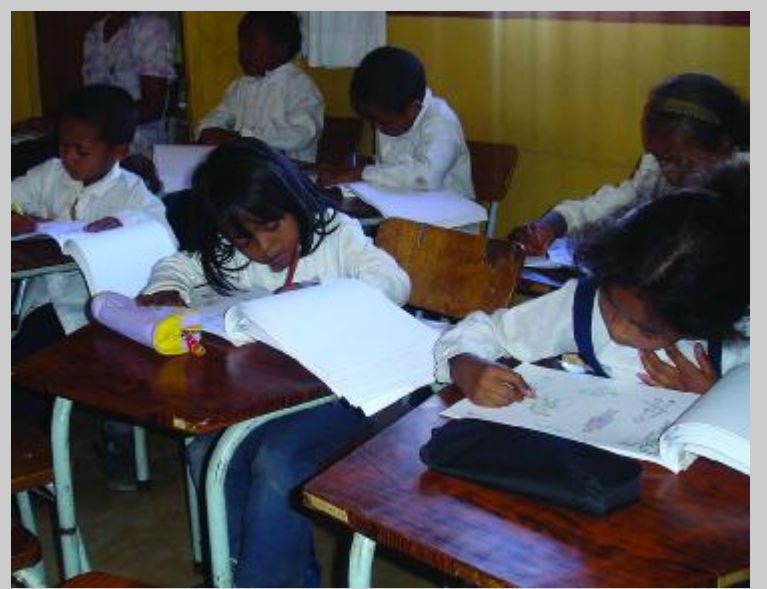
The governement will participate to allow deaf children to get into school.