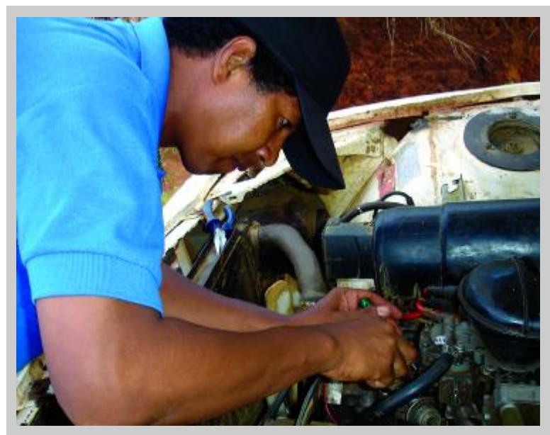
Those who get employment will get a legal salary and right free.