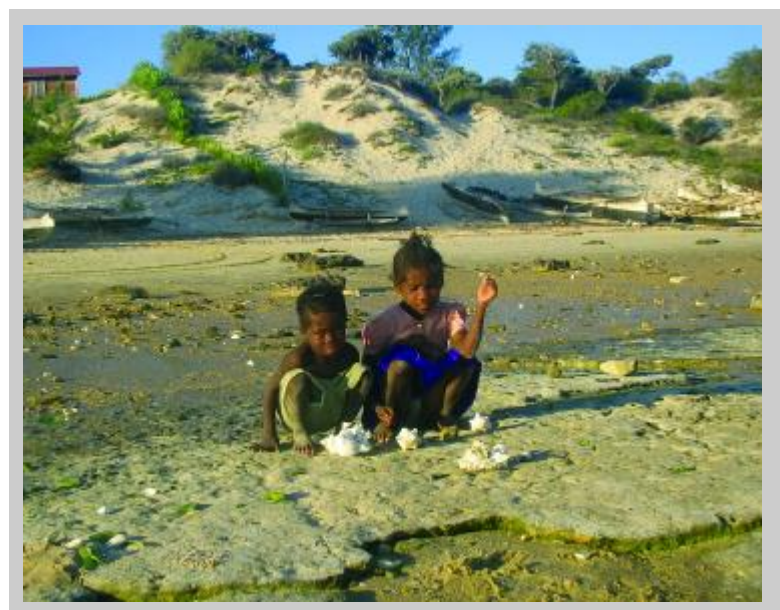
Many deaf children can not go to school. So, they will become burden for the country.