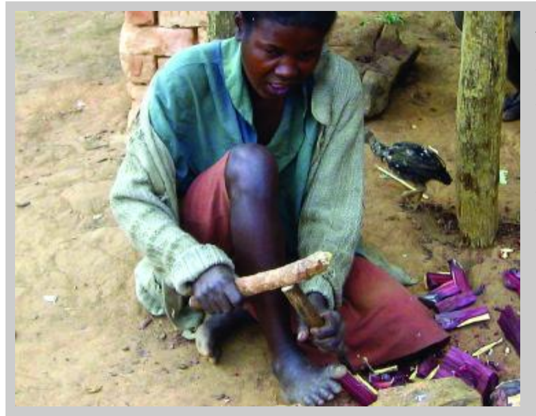
There are deaf people who try to make income themeselve but they get unsufficient money because of the lack of training.