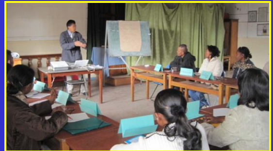
Deaf clubs training about Leadership