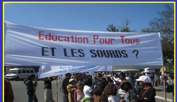
Deaf Day on Sept 2010