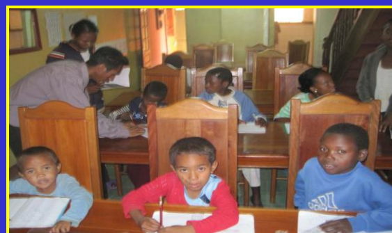
FMM established a Community Based Rehabilitation for Deaf people on Sept 2010