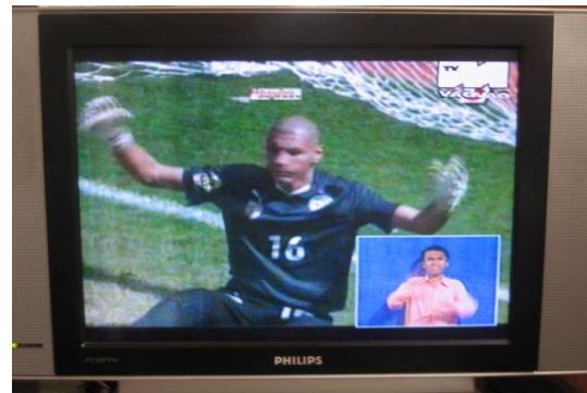
Mr Fidy interpreter news about AFRICA NATIONAL CUP OF THE FOOTBALL IN ANGOLA 2010 .