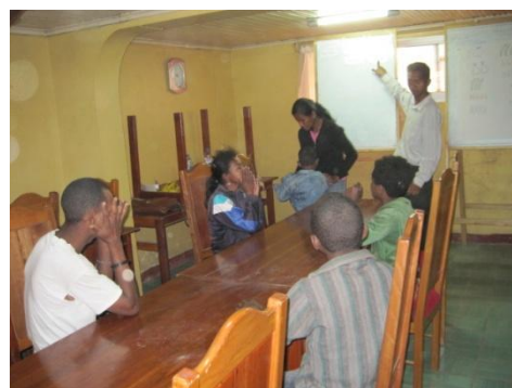
CBR 5 Deaf people in office FMM