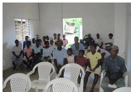
Deaf club and family of the Deaf children in Sainte Marie