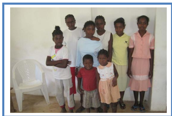
Deaf children don't know sign language. They want to Deaf school in Toamasina

written, read and mathematic.. FMM teacher how communicate sign language Communication Base Rehabilitation (CBR) for Sainte Marie and another Deaf clubs in regions on 2011