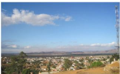
Town in Ambatondrazaka