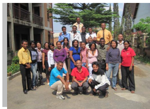
27 interpreters sign language met 1 st general assembly in Madagascar at Akama. 8 interpreters absents!