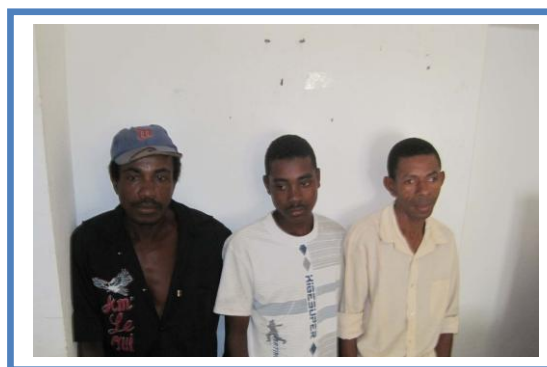
And Deaf adults want communication sign language in Deaf people in Toamasina, Bartho leader Deaf club in Sainte Mrie