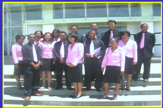
The second promotion interpreters sign language

FEDERASIONAN'NY MARENINA ETO MADAGASIKARA