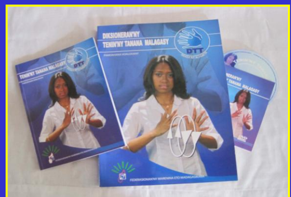
The first Sign Language Book.